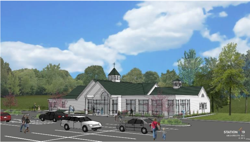
Artistic rendering of remodeled church building.